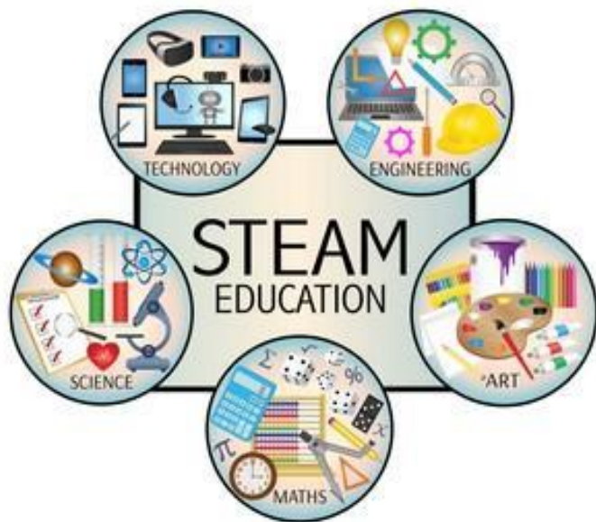
Figure 2. A depiction of STEAM education

Each industry has its own culture, its practices, knowledge, and ways of exchanging knowledge. These crucial differences between disciplines can shape how teachers teach the content of a subject and its related practices. However, understanding the culture, practices, and ways of knowing and sharing knowledge about STEM industries is only a milestone on the path to integration. One of the main challenges in integrated STEM teaching and learning is basic content knowledge and procedures in all disciplines (Psycharis, 2018; English, 2016). Children should be allowed to participate in specific practices of the various subjects and at the same time to recognize and understand how in each subject the skills and practices are mutually supportive and interact. Consequently, in a comprehensive STEAM teaching and learning (see Figure 2), children work collaboratively, use multiple tools, collect and analyze various data sources to solve a problem or challenge.