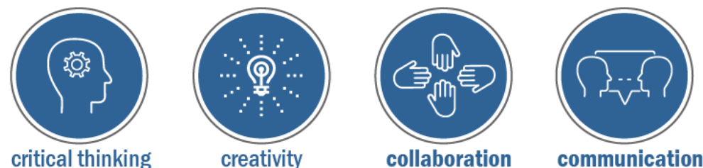
Figure 1. 21st century skills